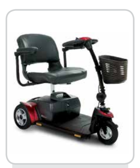
Go-Go Elite Traveller® Plus 3-wheel

PRIDE® MOBILITY SCOOTERS LIVE YOUR BEST®