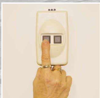
The two wireless call/send controls make the installation simple and clean with no wires running along the wall.

Easy on-and-off thanks to the Electra-Ride II's unique design.