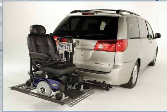
OUT-SIDER® MERIDIAN™ SERIES