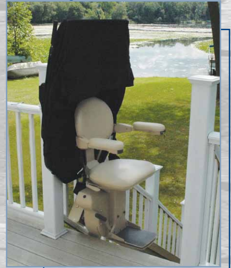
OUTDOOR ELECTRA-RIDE™ Model SRE-2010E The only 400 lb/ 181.8 kg capacity outdoor stairlift... an INDUSTRY EXCLUSIVE!