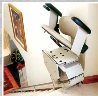
The arms, seat and footrest flip up, creating plenty of space for guests to walk up the stairs.