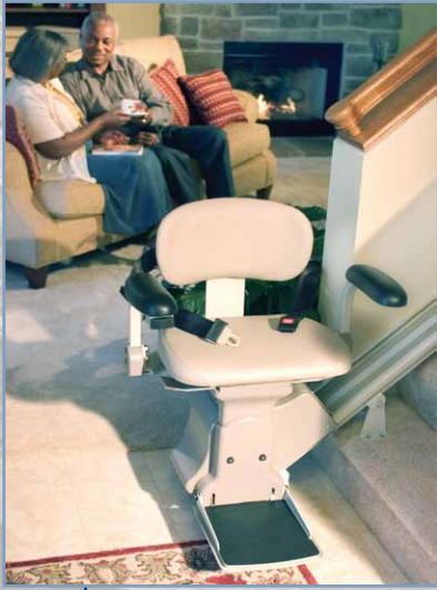
ELECTRA-RIDE™ LT Model SRE-2750