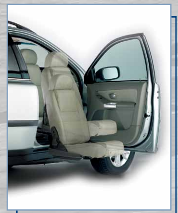
TURNY™ ORBIT® SEAT

1780 Executive Drive, P.O. Box 84, Oconomowoc, WI 53066 www.bruno.com