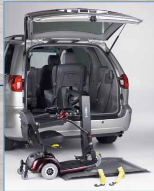
JOEY™ INTERIOR PLATFORM LIFT VSL-4000