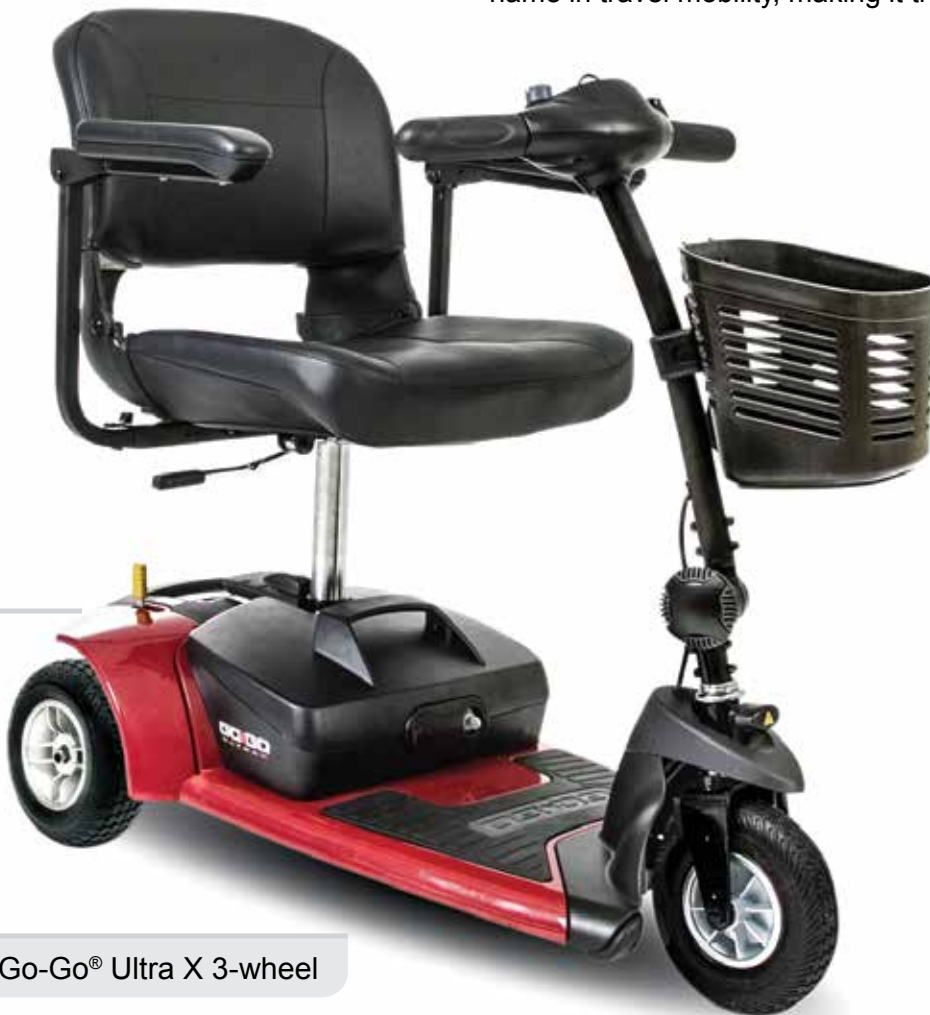
Go-Go ® Ultra X 3-wheel

The Go-Go ® Ultra X is loaded with design features like one-hand feather-touch disassembly and a convenient drop-in battery box that makes transport and travel worry free. The Go-Go ® Ultra X delivers these features and more, along with the performance you expect from the first name in travel mobility, making it the ultimate travel scooter value.