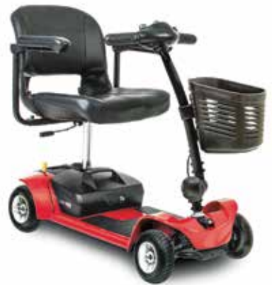
Go-Go ® Ultra X 4-wheel